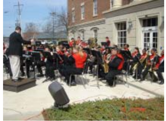
Baldwin High School Band