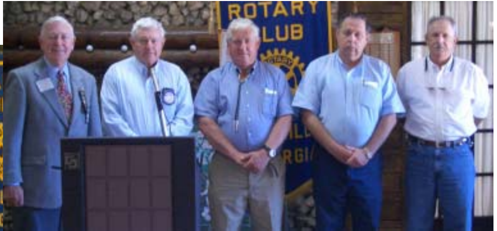
Tennille Rotary Club