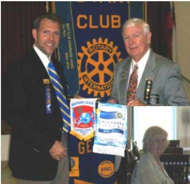
Warner Robins Rotary Club