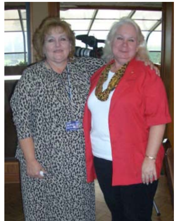
Vidalia Rotary Club