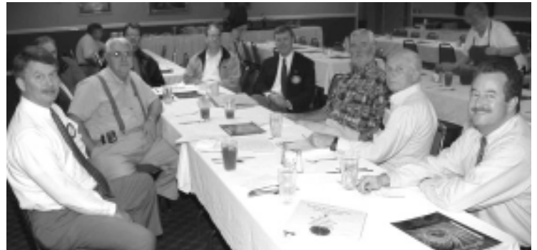
Douglas Rotary Club members enjoy food and fellowship.