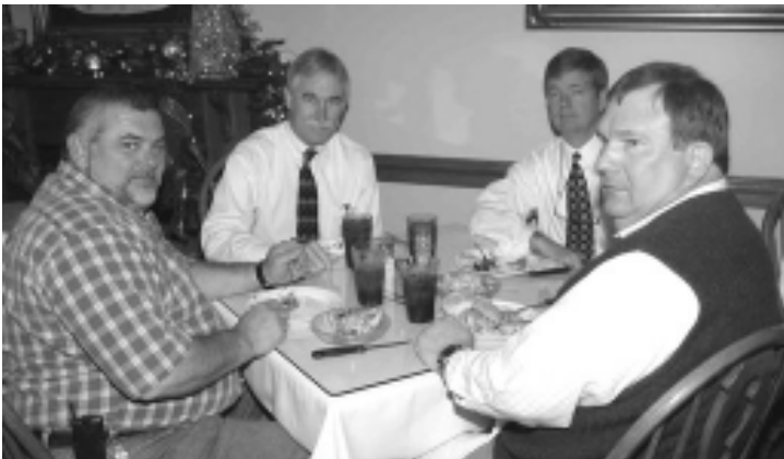
Members of the Jesup Rotary Club enjoy each other's company during a recent meeting.