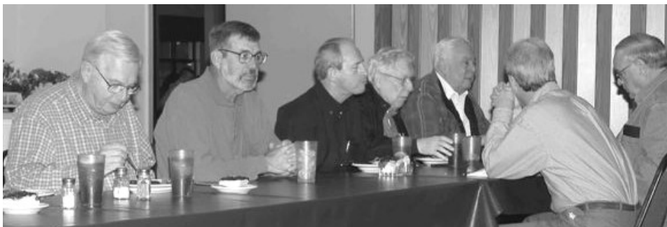
Members of the McRae Rotary Club talk during a recent lunch meeting.