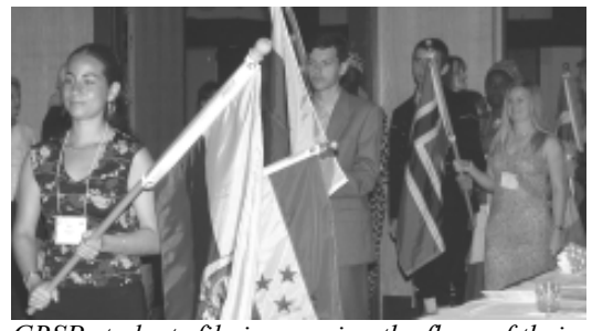
GRSP students file in carrying the flags of their native countries.