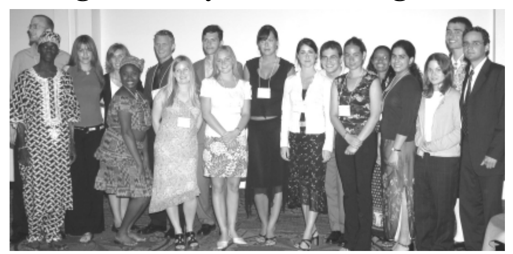
Members of the 2003 GRSP team pose for a group photo.