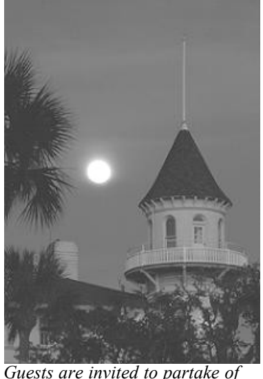
Guests are invited to partake of the equisite views (above) from the Jekyll Island Club Hotel.

Conference attendees can sign up to take a 1-1/2 hour lunch cooking class (right) at the hotel.