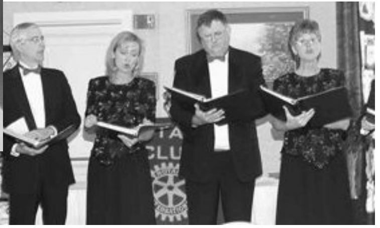
Members of the choral group Holiday Harmony entertain the Savannah East Rotary Club during their annual Christmas party.