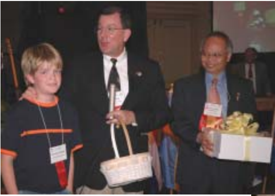
More Door Prizes