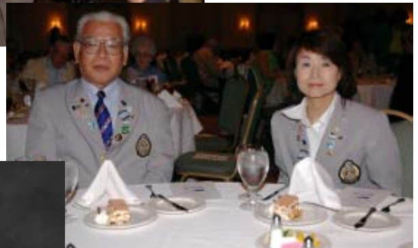
Members of the Incoming GSE Team from Japan Attend the Conference