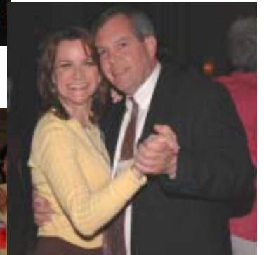
Attendees Enjoyed Dancing the Night Away