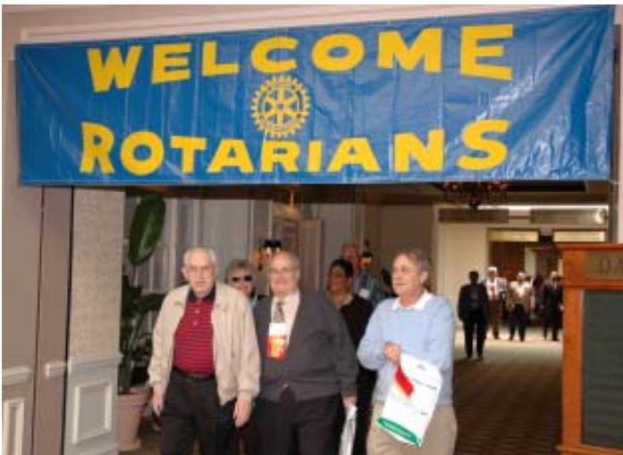
Rotarians and Guests were welcomed at the Radisson Riverfront Hotel in Augusta, site of the conference