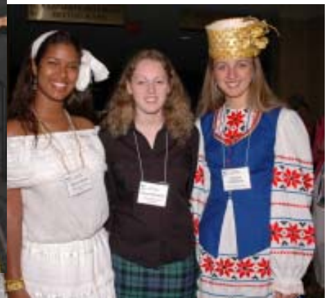
GRSP Students Donned Their Native Country's Attire for Saturday's Banquet