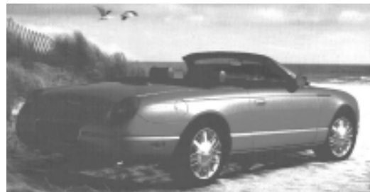
Raffle tickets for a red 2003 Ford Thunderbird are

To assist in the fund raising needed to rid the earth of polio, Rotary District 6920 is conducting a raffle for a new 2003 Ford Thunderbird automobile. The acquisition of a raffle ticket will require a $50 tax exempt donation. The chance of winning the top prize is at worst 1 in 10,000, depending on how many tickets are sold.