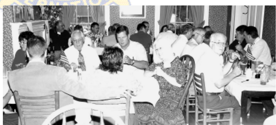
The Rotary Club of Effingham County Sunrise at breakfast during DG Montgomery's official visit on Aug. 13.