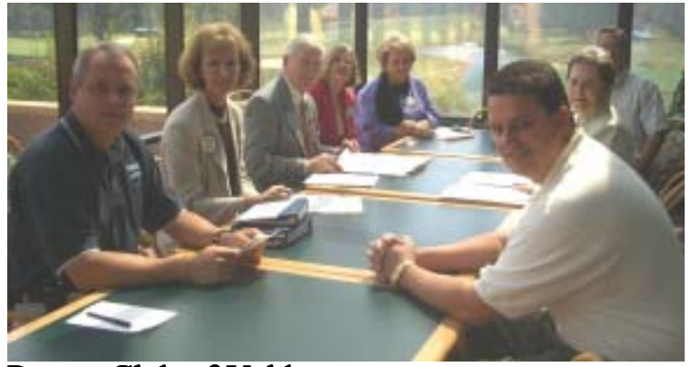
Rotary Club of Valdosta