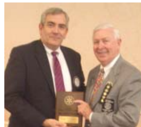
Rotary Club of Valdosta North