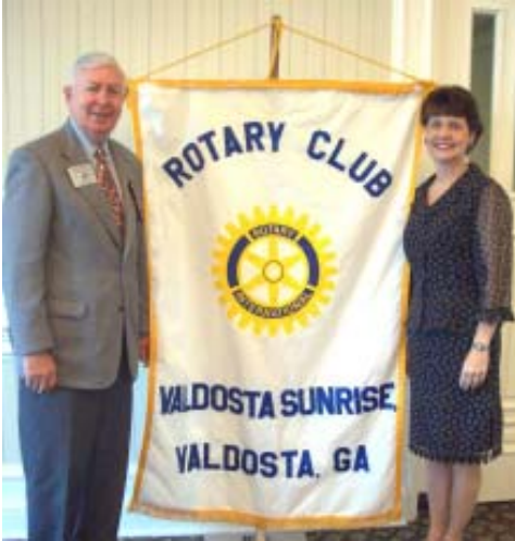
Rotary Club of Valdosta Sunrise (left)