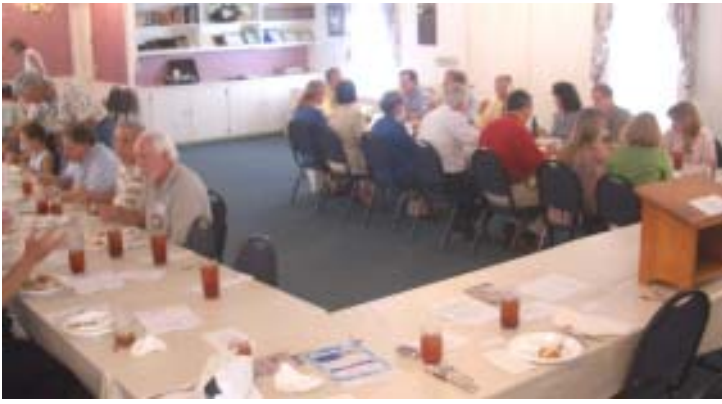
Rotary Club of Glennville