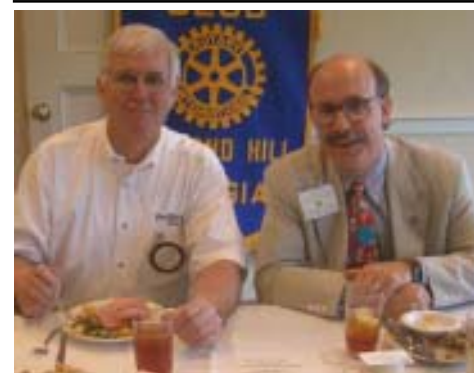
Rotary Club of Richmond Hill