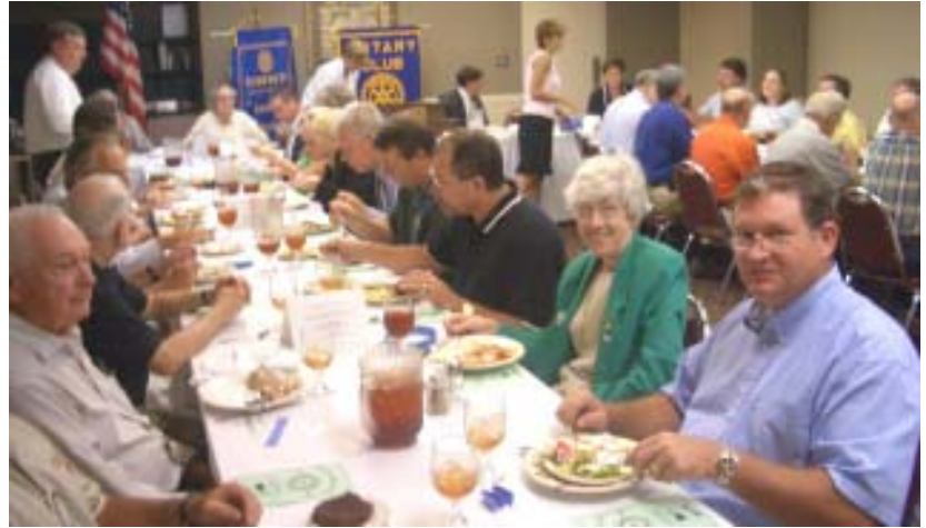
Rotary Club of Waycross/Blackshear (right)