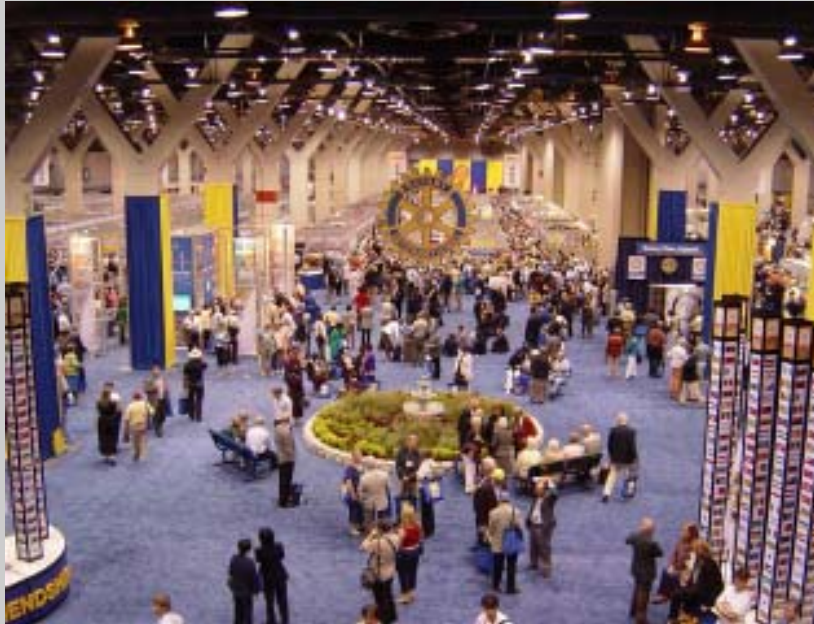
McCormick Center Scene