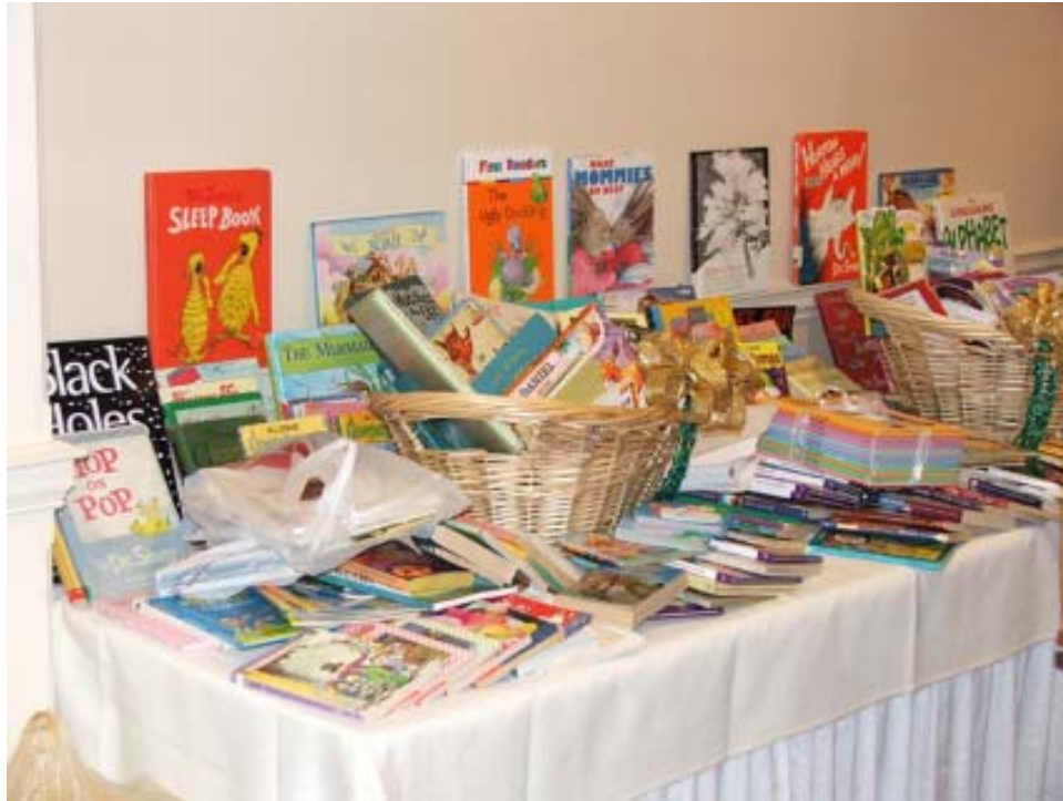
The Rotary Club of Dublin