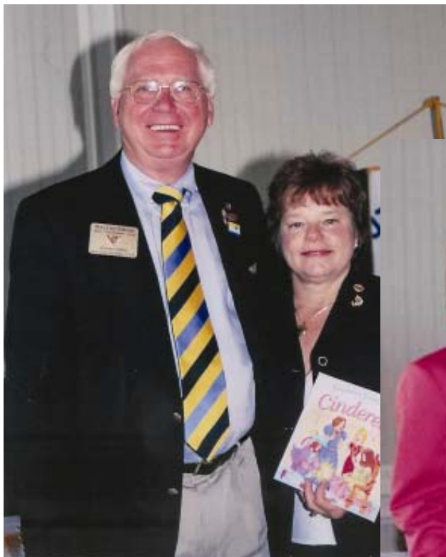
The Rotary Club of Valdosta Sunrise