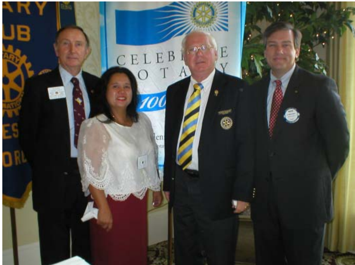
The Rotary Club of Statesboro