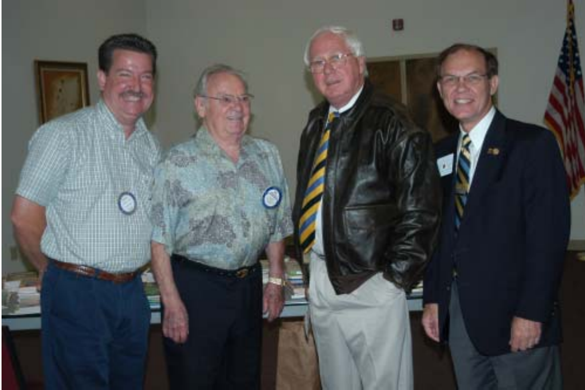
The Rotary Club of Warner Robins