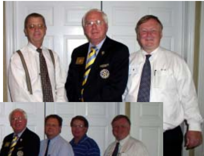
The Rotary Club of Swainsboro