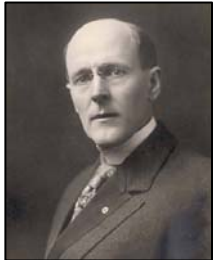
100% Paul Harris Fellow Clubs