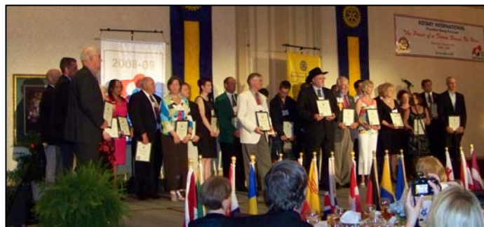
Governor's Citation Clubs