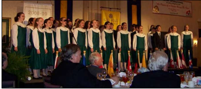
We enjoyed a marvelous presentation by the Augusta Children's Chorale