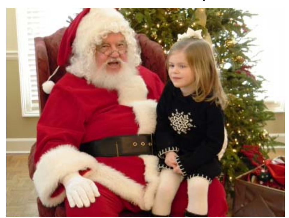
On December 23, 2010, the Sandersville Rotary Club welcomed members, their children and grandchildren for lunch and a visit with Santa. After a kid-friendly meal of chicken tenders, mac-'n-cheese, and spaghetti, the children were able to sit on Santa's lap & tell him exactly what they wanted for Christmas. The requests ranged from "candy" to a "red car".....that would be a real "red car". Everyone had fun watching the children's eyes light up when it was their turn to sit with Santa.