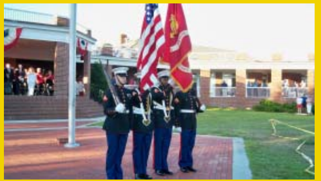
The Marine Security Forces posted the colors during the annual program.