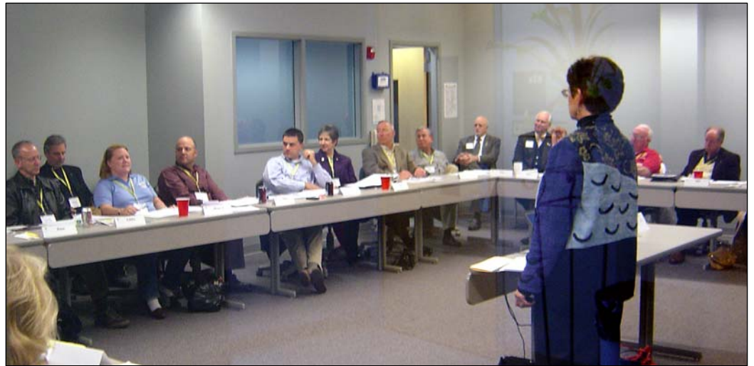
Rotary Leadership Institute – Part 1, Dublin, Georgia