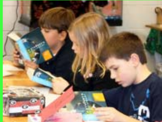
The Claxton Rotary Club has completed distributing 264 dictionaries to all third grade students in Claxton and Evans County. These were supplied through a District Simplified Grant approved for the club and funds from The Claxton Rotary Club for "the dictionary project."