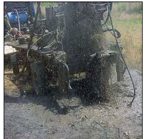
Water gushes to the surface