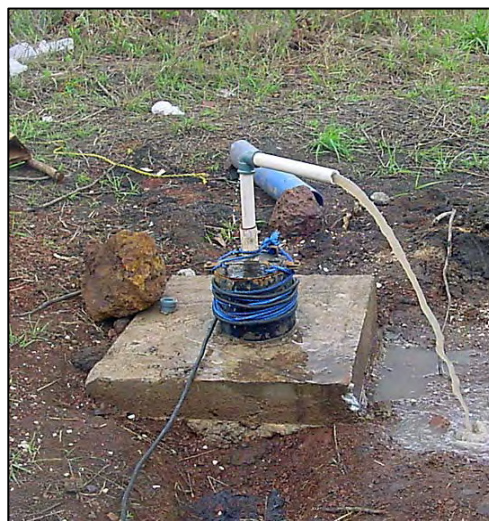
Clean water ready for use