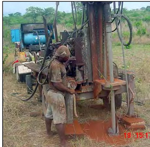
Bore hole drilling begins

The students at the school previously have had to bring water from some distance for their daily needs. The excitement among them was quite evident as the project got under way. Photos posted below show the beginning phase of the project through to the final clean water success. (See photos below)