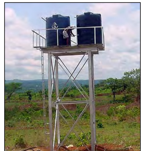
Storage tanks erected