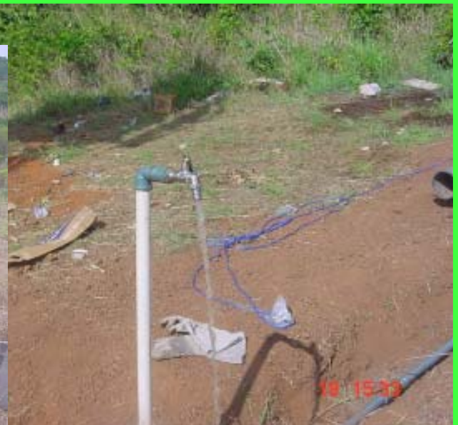
Drilling the second bore hole (left) and finally, water (above).