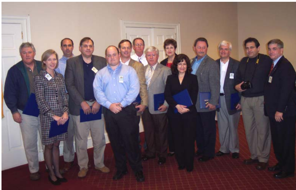
The Rotary Club of Dublin recently recognized fourteen new Paul Harris Fellows at their weekly club meeting on November 15, 2008.