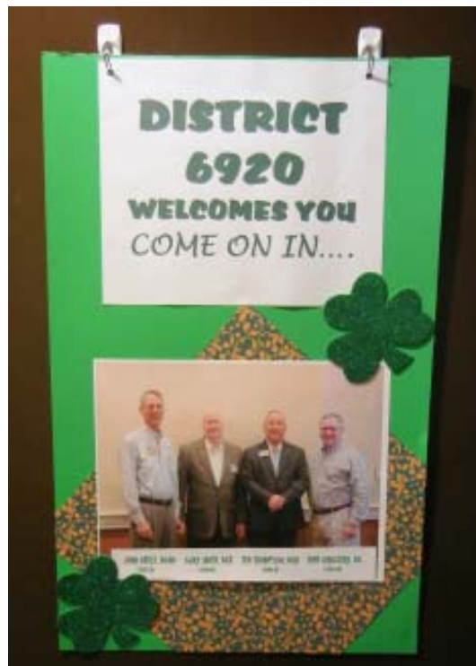
Door cover welcomes all to District 6920's hospitality suite