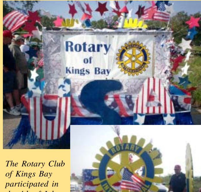
the 4th of July parade in downtown St. Marys, GA.