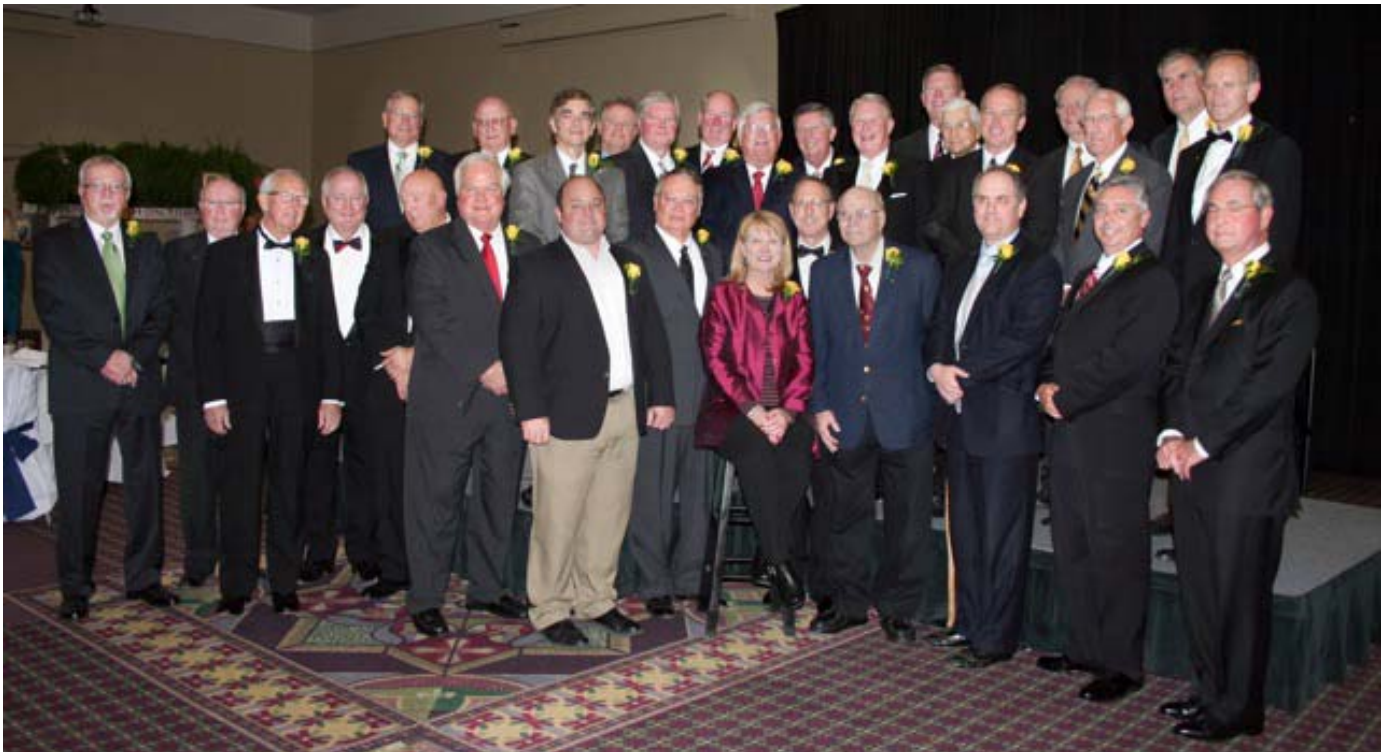
More than 200 Rotarians and guests attended the 75th anniversary celebration of the Dublin Rotary Club. Among the guests were 30 of the club's past presidents, pictured above.