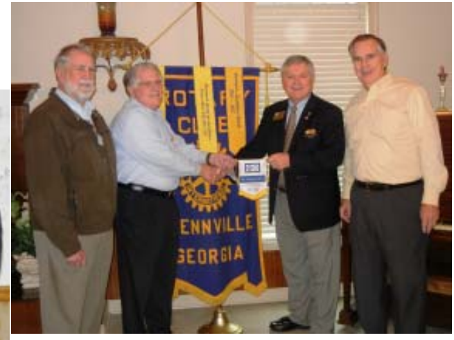
The Rotary Club of Glennville

Third place at $196.55 per member – The Rotary Club of Glennville