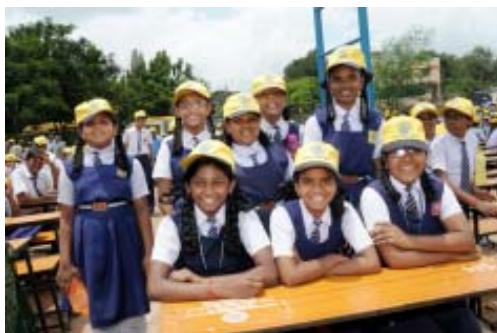
School desks for children in India

Of course these are still within the basic mission of Rotary under the past matching grant program model, and they are broad enough to encompass most types of humanitarian projects. Other selection criteria include 1) projects must be over $30,000 total, including all funding sources, 2) projects must be sustainable over at least 3-5 years, with provisions, for instance, for maintenance on any equipment and education/training on its use, and 3) projects must have measurable results. The Foundation will still match international and US club cash contributions fifty cents on the dollar, and DDF allocated by the District will be matched dollar for dollar.