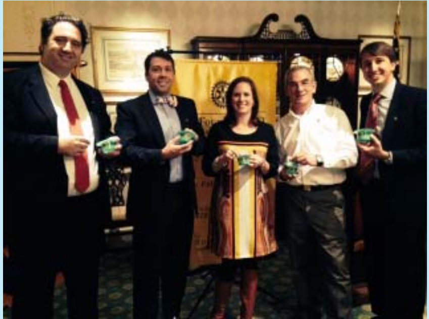
Macon North Rotary sponsored a Foundation Fundraiser project on March 20, 2014. All Rotarians were asked to bring dimes to the meeting. A St. Patrick's Day Theme was carried out and each Rotarian placed their dimes in Green St. Patrick's Day hats. Hats were weighed and the winner of the heaviest hat received a bag of gold chocolate coins. The fundraiser raised $50.