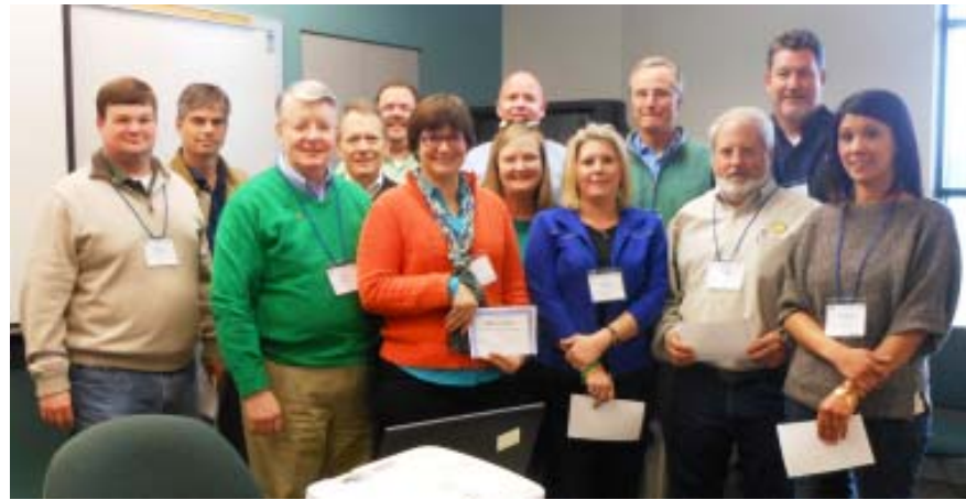
Above, some of the graduates of the March 15, 2014, RLI.

The next District 6920 RLI session will be held Saturday, May 17th in Savannah on the Savannah Technical College, Crossroads Campus, located in Pooler. Registration is open and can be made at www.rlitraining.org . We look forward to seeing many of our Dublin folks and other fellow Rotarians.