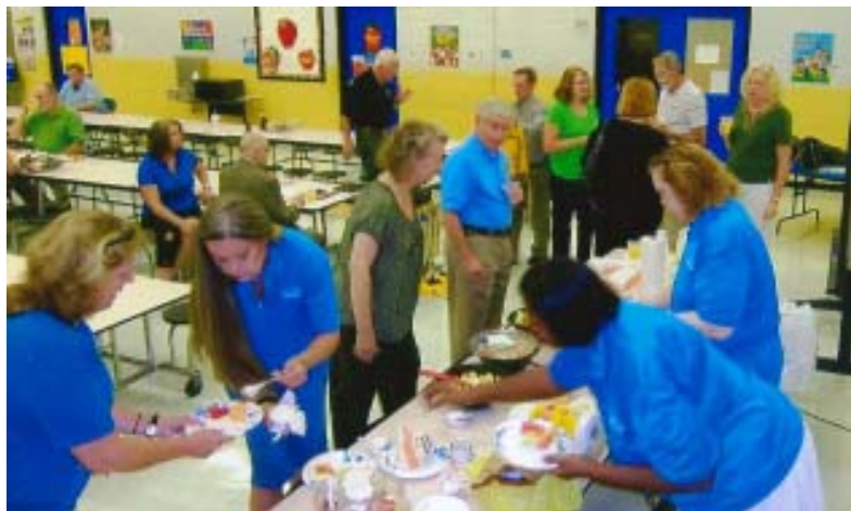
Augusta West Rotarians participated in A Bryan Merry Elementary School's 2013 Welcome Back breakfast.

Every year brings something new and always rewarding to each adult, and 2014-15 will be no different. Warm hallway greetings to Mentors ring out from last years students, rich payment of "love and hugs" from kids knowing that they're special.