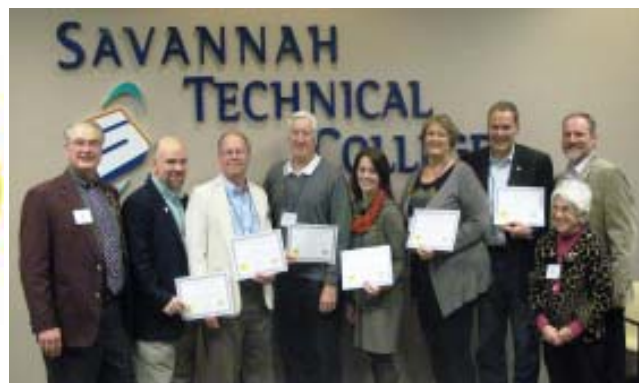
Part 3 Graduates