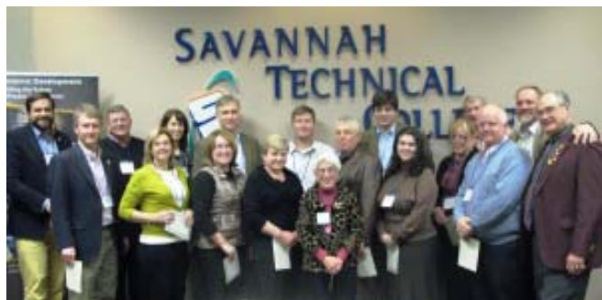
Part 1 Graduates

District 6920 hosted a very successful RLI session on Saturday, January 17th. Participants attended from as far away as Milledgeville and Perry and down south from Camden County. We had healthy representation from the Savannah and Hilton Head Rotaries.