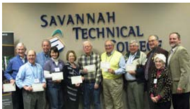
Part 2 Graduates

Please go to www.rlitraining.org to register.