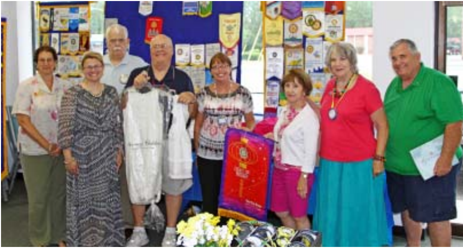
Rotary Club of Kings Bay recently made a sizeable donation of clothes, shoes and other items to the Salvation Army.